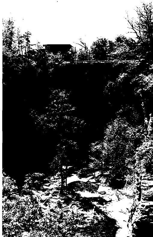
Can You Name this Building on the Cornell Campus?